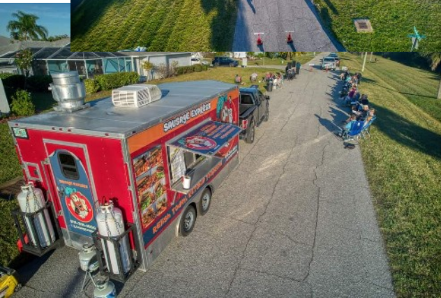
Drone pix courtesy of Paul Ayoub