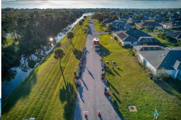
Cornhole practice was provided by Tom Myers in preparation for the upcoming tournament.