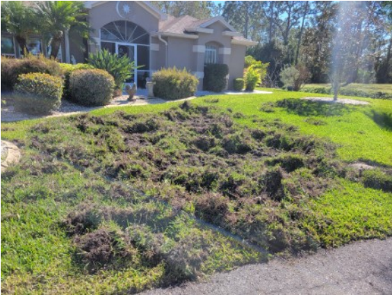
Hog Damage - The Saint Augustine Grass will not recover.